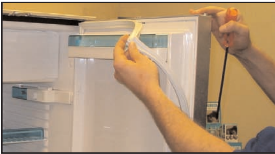
1. Remove rubber gasket from the interior door.

Unlike most front-loading refrigerators, the CR Series face panel is interchangeable—while installed in your boat or RV.