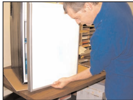
5. Slide in preferred face panel.

Re-insert door handle, re-fasten 4 screws, re-apply rubber gasket.