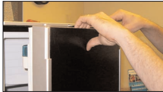
4. Remove the existing face panel, by sliding it up and out of the door surround.

{Photo right shows unit with the face panel completely removed.}